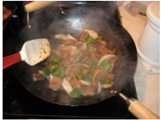
Plate and eat.

Dump the beef back in the wok. Let beef heat back up and then dump in the sauce. Stir it and it will thicken up.